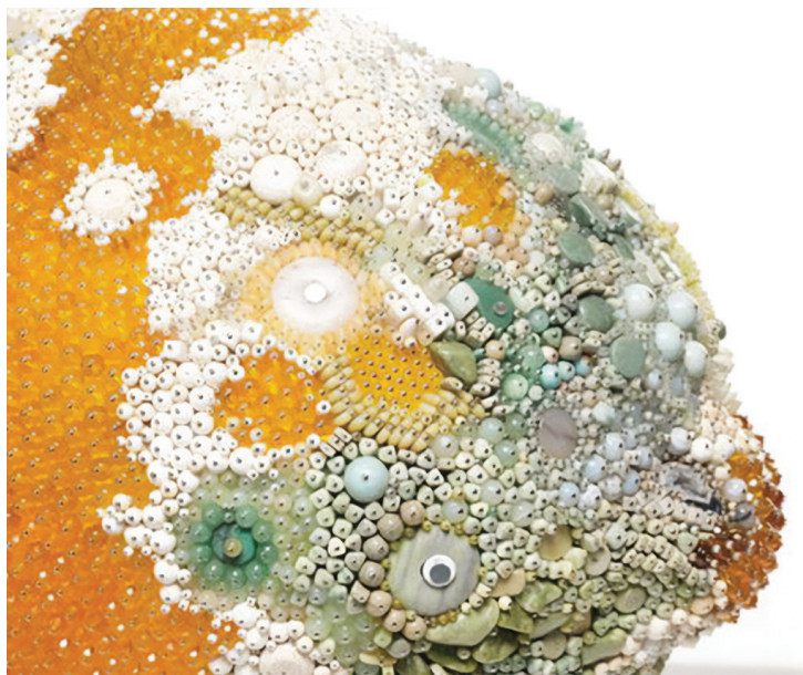
Bad Lemon (Lichen) ; (detail)